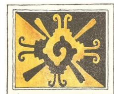
Myan Hunab Ku

ESCYPAA III Coming October 28-30, 2016 For info, www.escypaa3.org